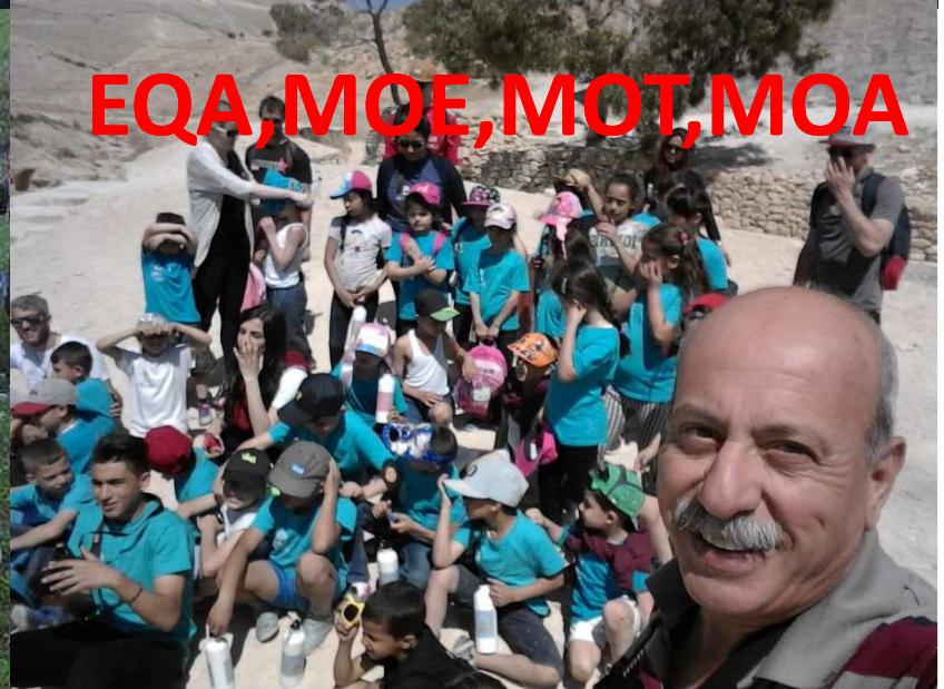
EQA, MOE, MOT, MOA