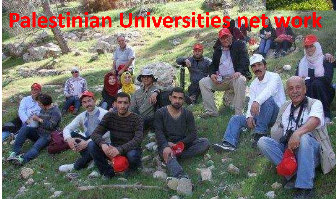
Palestinian Universities net work