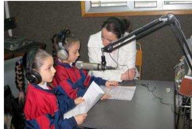
Radio and TV Programmes