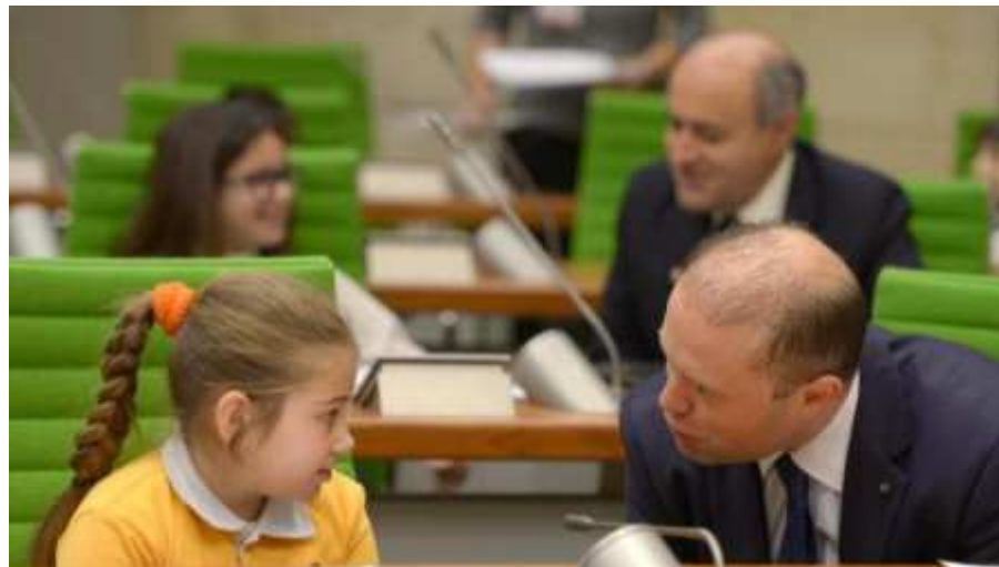
Members of Parliament