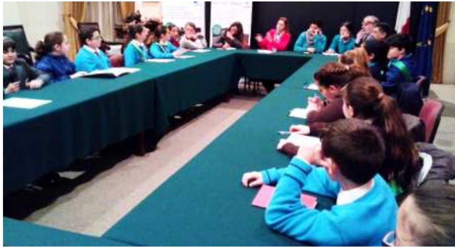
Eco-Schools Regional meeting with Minister for Gozo