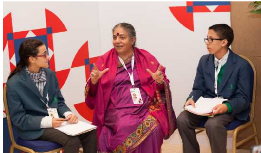
Meeting delegates attending the CHOGM 2015