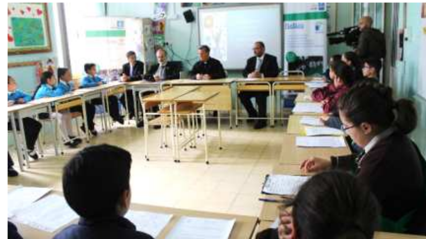
Meeting with Bishop