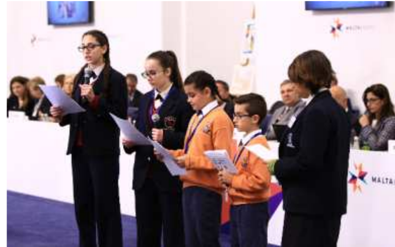
Informal Meeting of the EU Environment Council