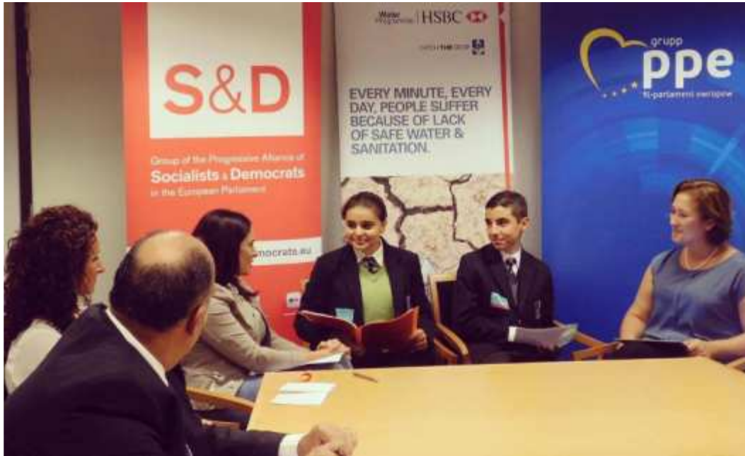
Meeting with MEPs at the European Parliament