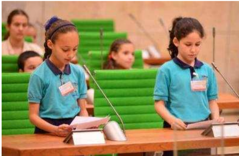
Eco-Schools Parliament session