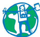
Young Reporters for the environment